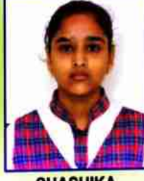
SHASHIKA Med. (86.8%)