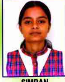
SIMRAN Arts (82.2%)