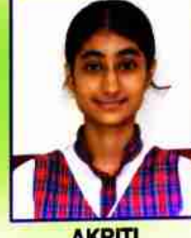
AKRITI Non-Med. (85.2%)