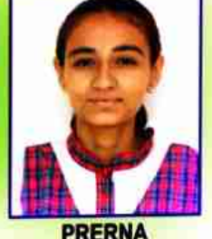
PRERNA Comm. (81.6%)