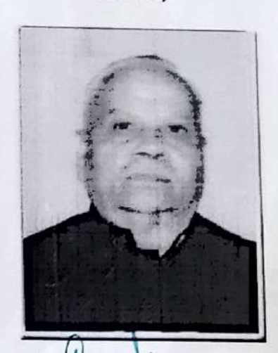
Principal Principal Principal NAWANSHAHR